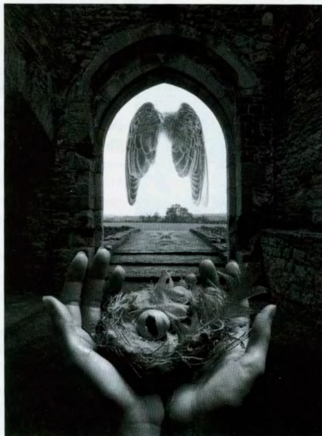
Tintern Abbey

In the studio, she works on her 21-inch monitor with extremely high resolution to complete the details. The finished works are Irises printed at High Resolution in Camden, Maine.